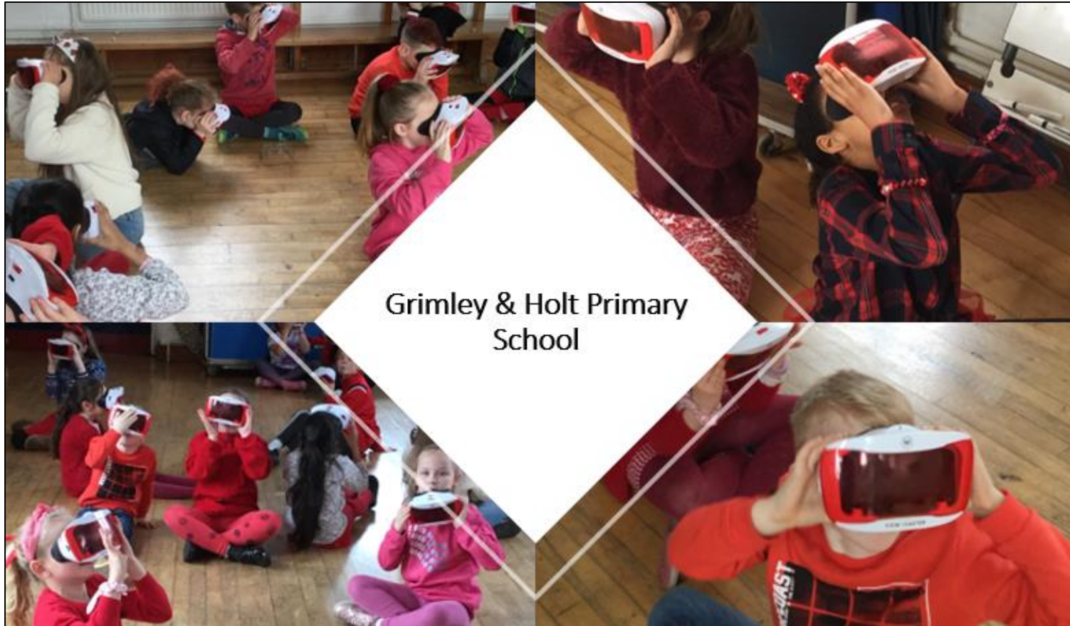
Grimley & Holt Primary School

We used funding from the Ogden Trust towards having a VR Space workshop come into school as part of a science week enrichment. An excellent opportunity and the children retained so many facts.